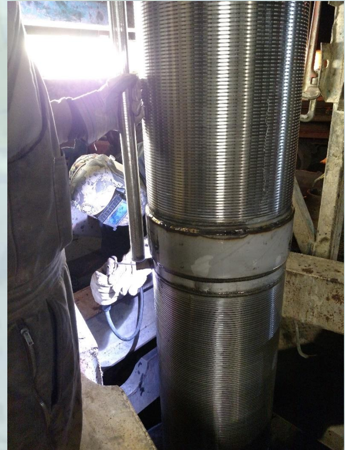
WIRE WRAP WELL SCREEN