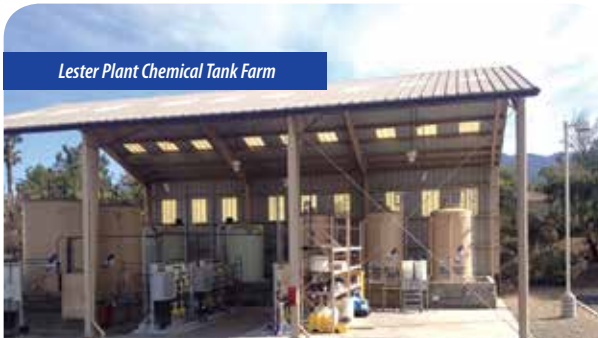
Lester Plant Chemical Tank Farm