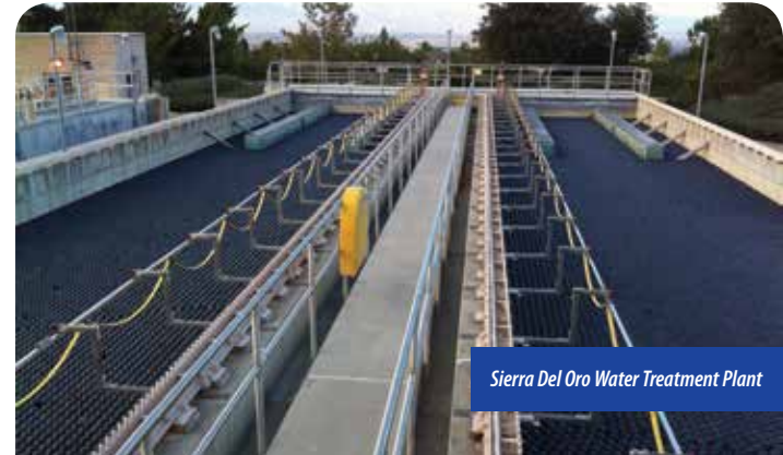
Sierra Del Oro Water Treatment Plant

Governor Edmund G. Brown Jr. ended the drought state of emergency in most of California on April 7, 2017, while maintaining water reporting requirements and prohibitions on wasteful practices, such as watering during or right after rainfall. The State released a long-term plan to better prepare the state for future droughts and make conservation a California way of life. Building on the successes and lessons learned from California's five-year drought, the plan establishes a framework for long-term efficient water use that reflects the State's diverse climate, landscape, and demographic conditions.